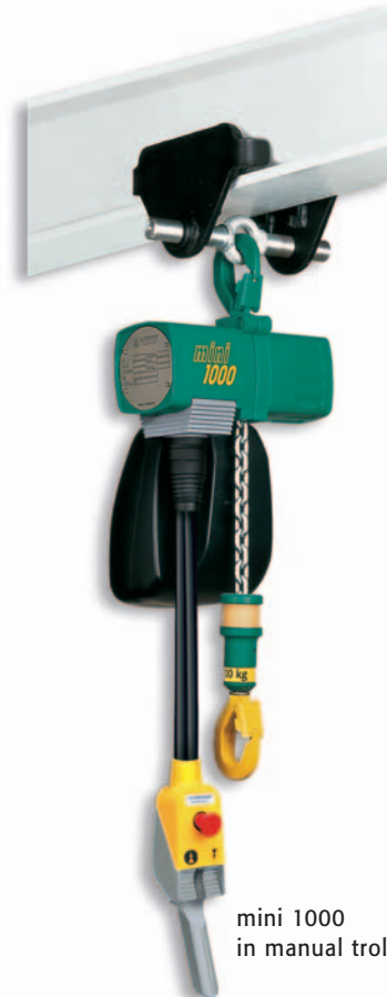
mini 1000 in manual trolley